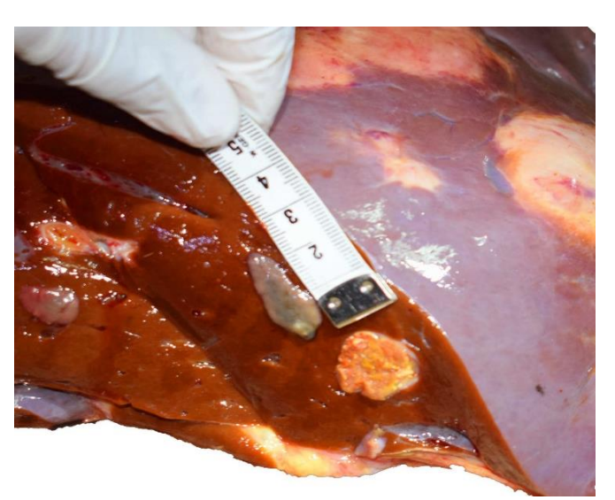
Figure 1: Fasciola hepatica parasite detected in cattle's liver at the Central Slaughterhouse, Dhamar Branch (CSDB).

As shown in Figure 1, F. hepatica parasite in cattle's liver was detected by specialized veterinarians at the Central Slaughterhouse, Dhamar Branch (CSDB). It measured about 2.3 centimeters long. This figure was taken during our visits.